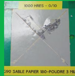
G90, SANDED AND THEN POWDER COATED (WITHOUT CHEMICAL PRETREATMENT)